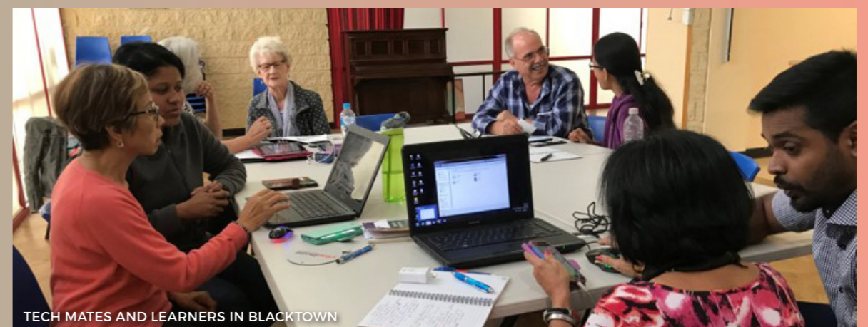
TECH MATES AND LEARNERS IN BLACKTOWN