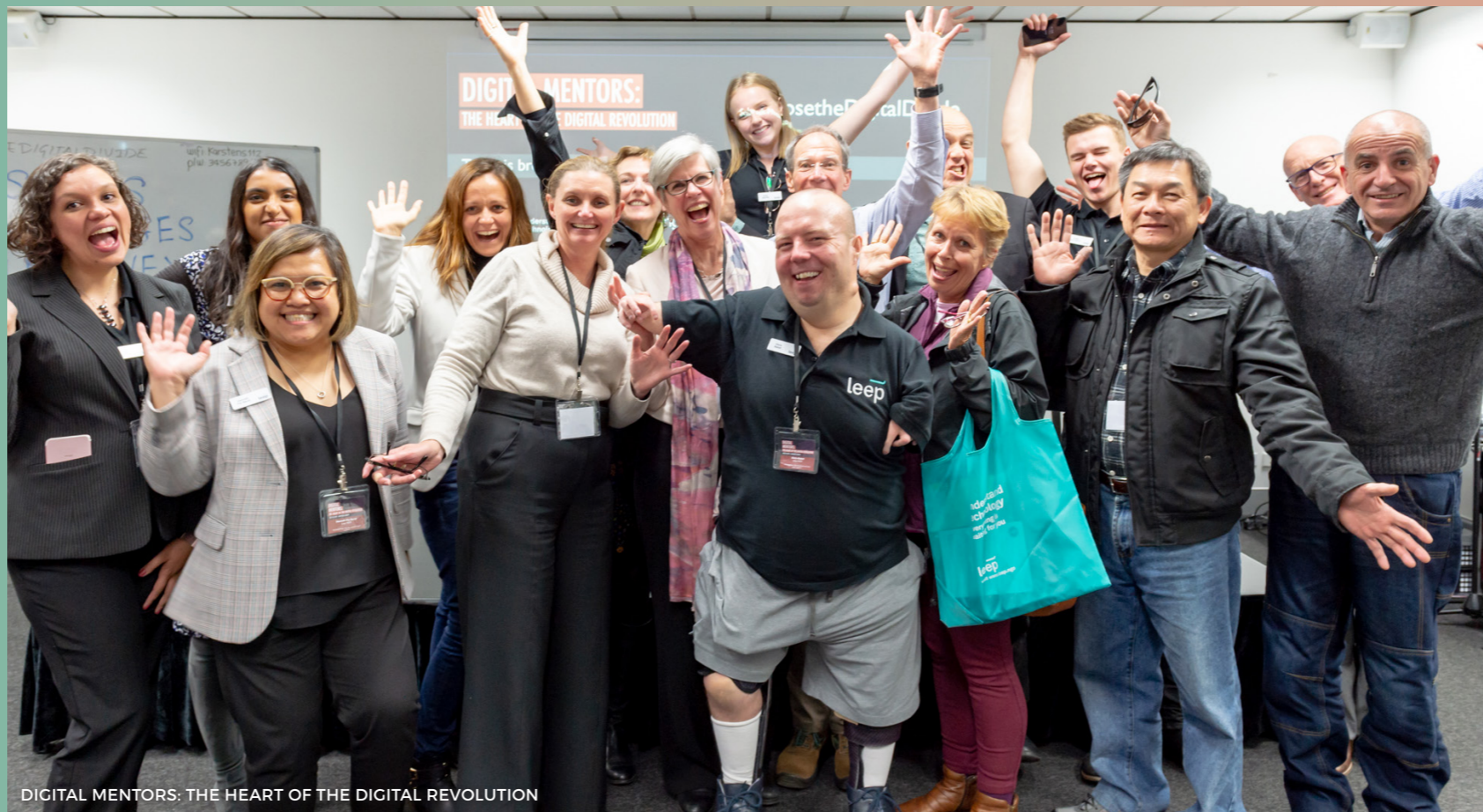
DIGITAL MENTORS: THE HEART OF THE DIGITAL REVOLUTION