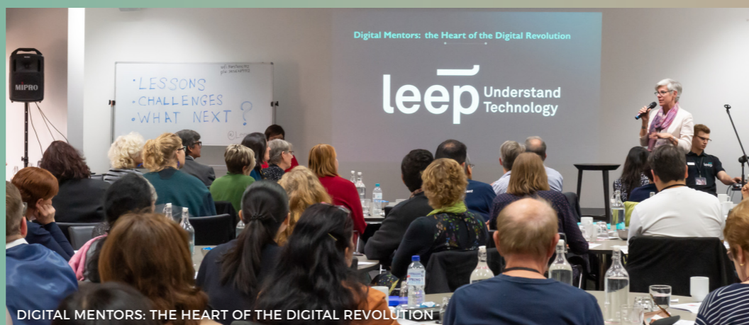
DIGITAL MENTORS: THE HEART OF THE DIGITAL REVOLUTION