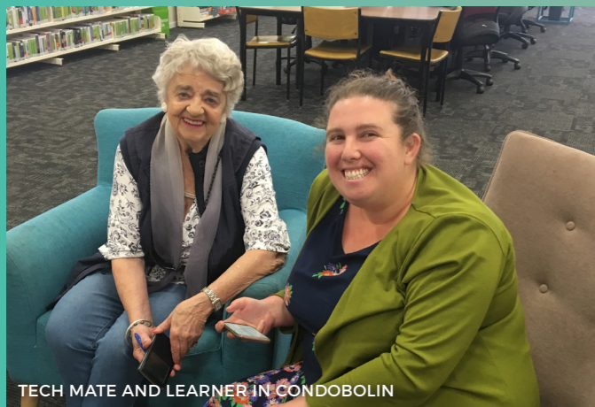
TECH MATE AND LEARNER IN CONDOBOLIN