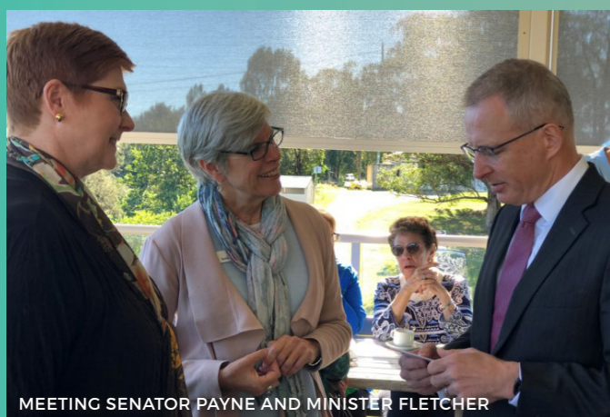
MEETING SENATOR PAYNE AND MINISTER FLETCHER