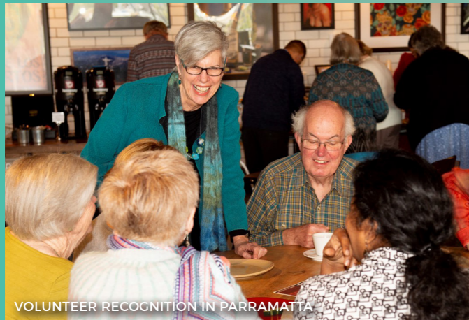
VOLUNTEER RECOGNITION IN PARRAMATTA