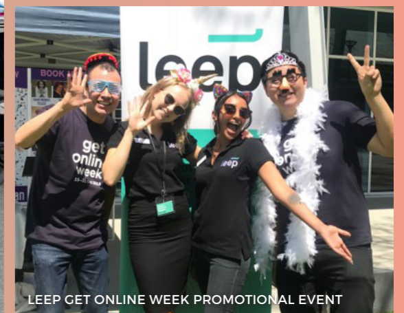
LEEP GET ONLINE WEEK PROMOTIONAL EVENT