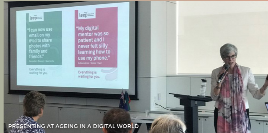
PRESENTING AT AGEING IN A DIGITAL WORLD