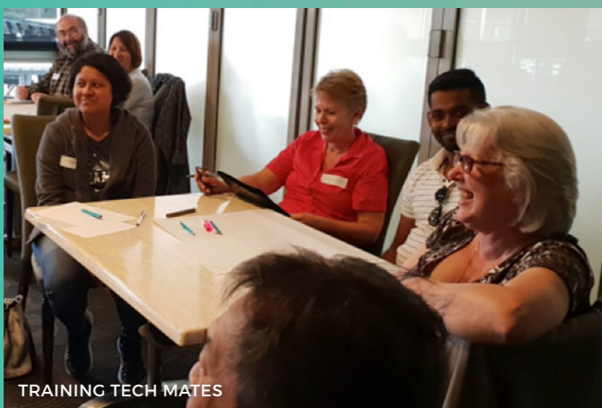
TRAINING TECH MATES